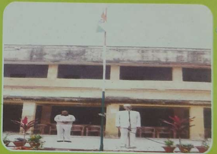
Flag hoisting by the Principal on Republic Day