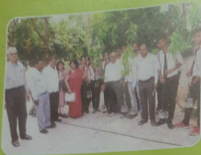
'Van Mahotsav' organized by NSS