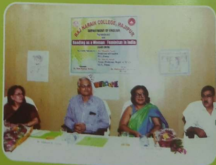
Seminar organized by the Deptt. of English