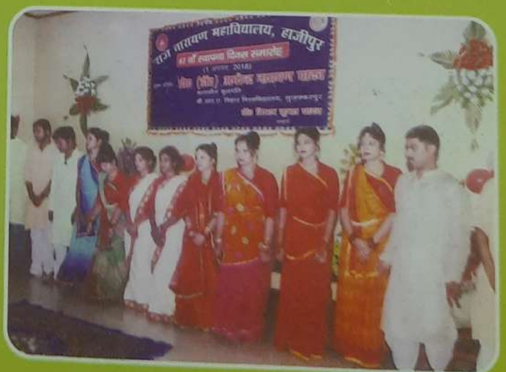
Cultural Programme (67 th Foundation Day : 01 Aug, 2018)