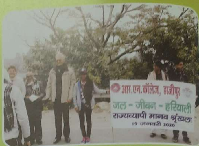
Formation of JAL - JIVAN-HARIYALI- Rajyavyapi Manav Shrinkhla by Students and teaching and non-teaching staff of the college on 19 Jan. 2020