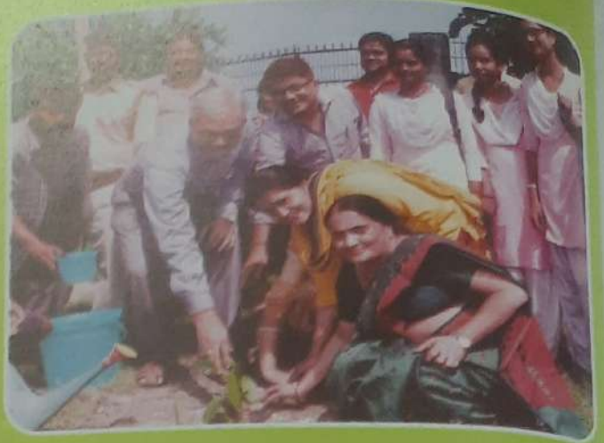
'Van Mahotsav' organized by NSS