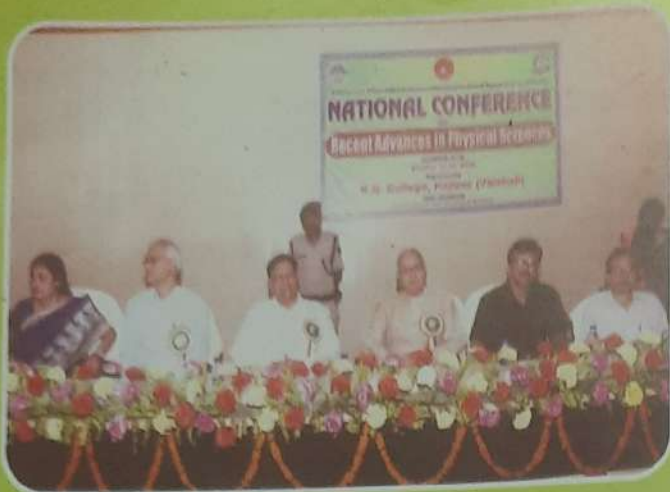
National Conference on Recent Advances in Physical Sciences (Pro-V.C., Principal & others)