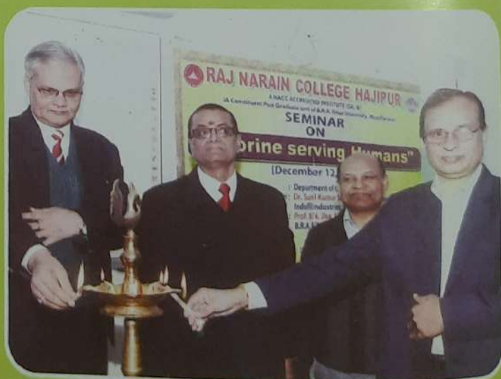
Seminar organized by the Deptt. of Chemistry