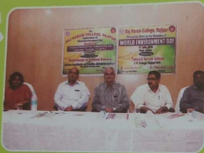
Seminar Drive on the occasion of World Environment Day