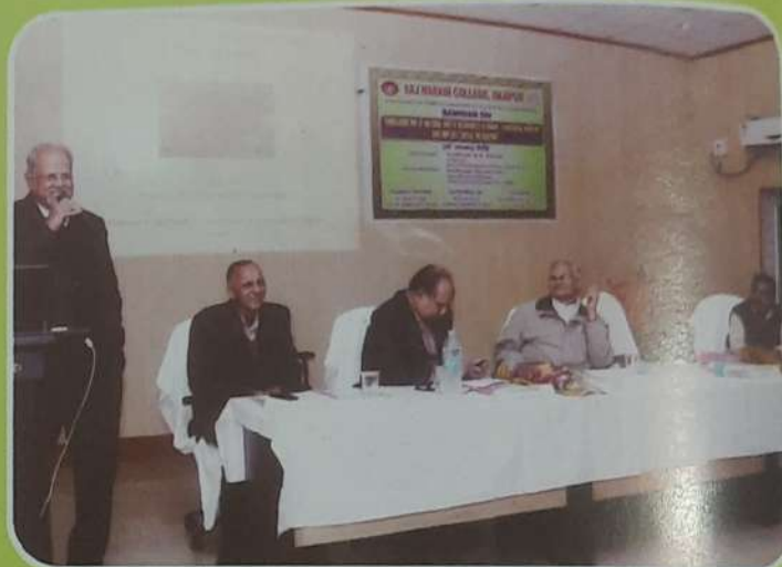
Seminar organized by the Deptt. of Botany