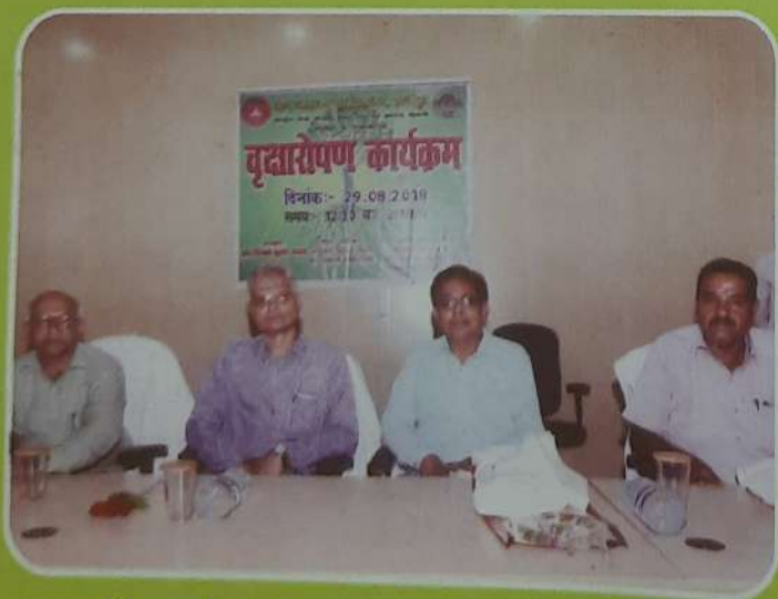
Plantation Programme in collaboration with District Forest Officer, Vaishali