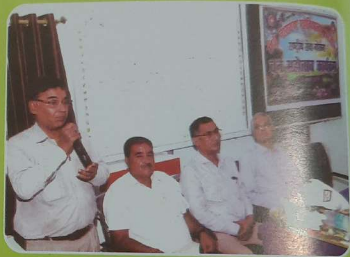
'Van Mahotsav' organized by NSS