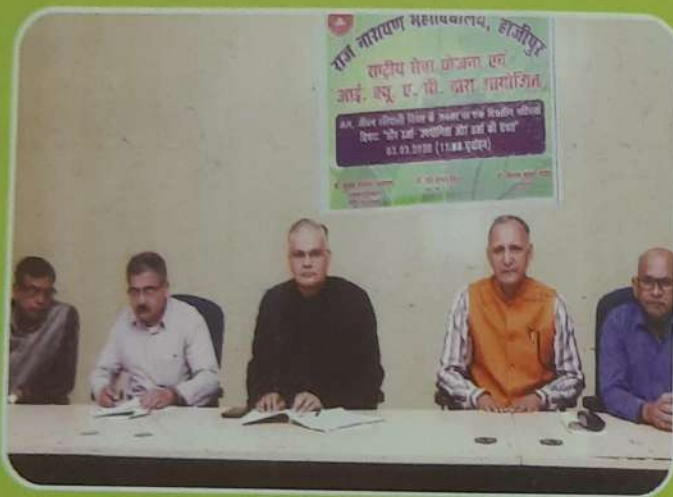
'Jal-Jeevan-Hariyali' Programme organized by NSS & IQAC of the College