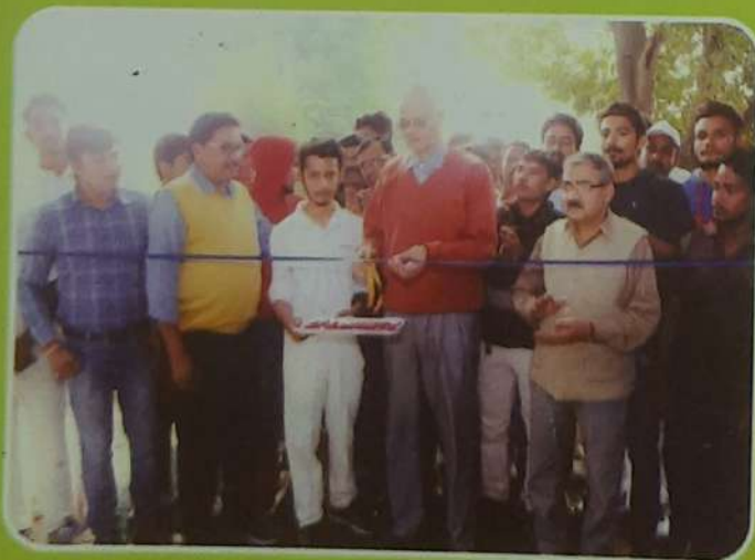
Inauguration of Cricket Pitch by the Principal