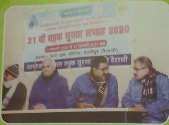
31 st Road Safety Week Celebration organized by the D.T.O., Vaishali and R.N. College, Hajipur